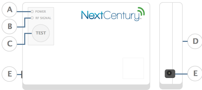
Figure 1 RE-201 Hardware

A Power Indicator B RF Signal Indicator C Test Button D Mounting Plate E 12 Volt Power